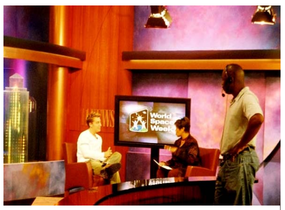
U.S. television station broadcasts live interview of World Space Week 2003 Youth Spokesperson

World Space Week was declared in 1999 by the United Nations General Assembly, implementing a key recommendation of the Third United Nations Conference on the Exploration and Peaceful Uses of Outer Space (UNISPACE III). The objective of World Space Week is to increase awareness among decision makers and the public of the benefits of the peaceful uses of space. World Space Week is held from 4-10 October annually.