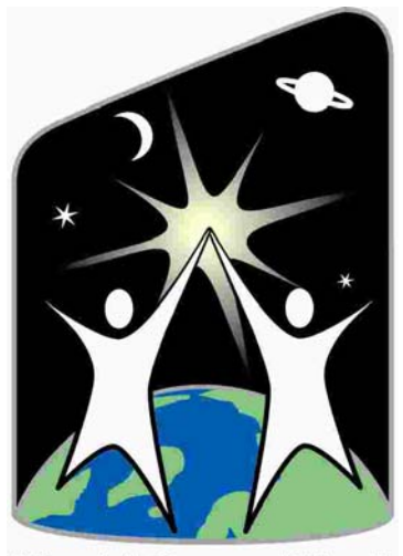
World Space Week

For information on how to become an affiliate of the Association, please visit <a href="www.spaceweek.org/affiliates.html">www.spaceweek.org/affiliates.html</a>