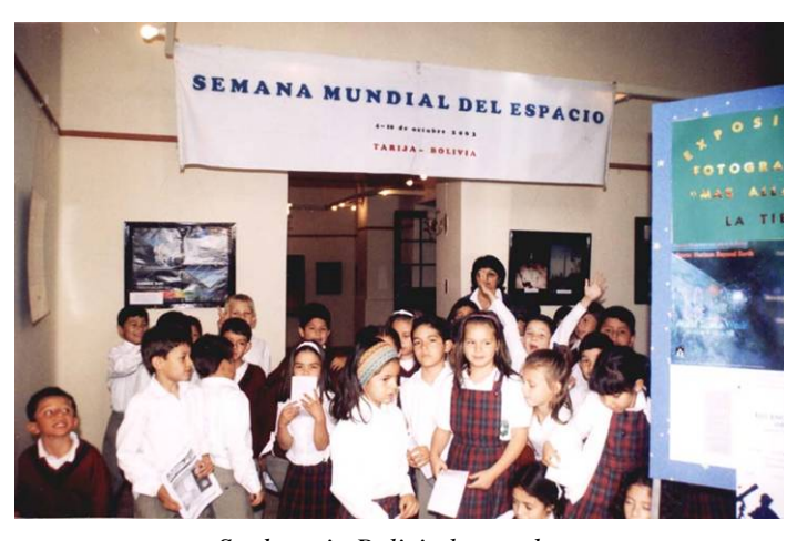
Students in Bolivia learn about space during World Space Week 2003

For further information, please visit <a href="https://www.spaceweek.org">www.spaceweek.org</a> or email <a href="mailto:admin@spaceweek.org">admin@spaceweek.org</a>.