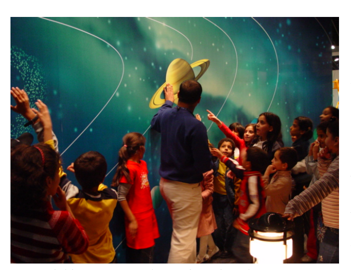
Children in Kuwait learn about the solar system during World Space Week 2005

Since its declaration, World Space Week has grown to include celebrations in nearly 50 nations. This report includes information on celebrations of World Space Week held by participating organizations such as government agencies, companies, schools, museums, planetariums and other institutions in 46 nations. A global network of 58 volunteer coordinators now supports these participants and promotes the celebration.